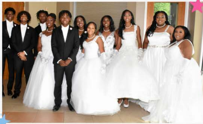
GTC 2022 Cotillion Participants