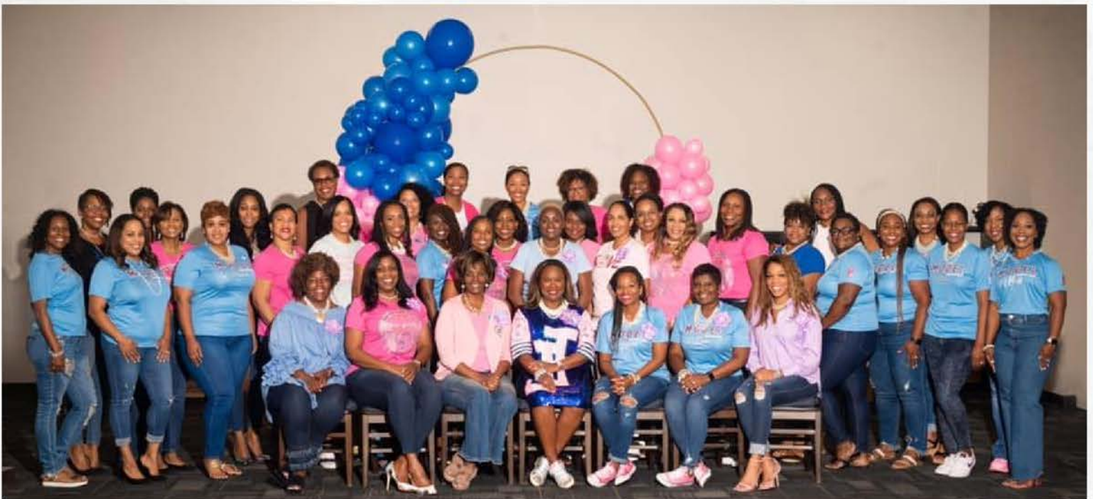
Greater Tampa Chapter Members

Greater Tampa Chapter of Jack and Jill of America, Inc. has a demonstrated history of community service and philanthropic giving