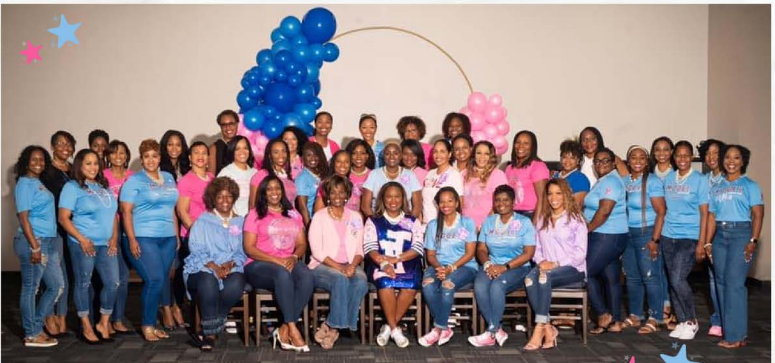
Greater Tampa Chapter Members

THE POWER TO MAKE A DIFFERENCE For All Children ON MISSION. ON PURPOSE.