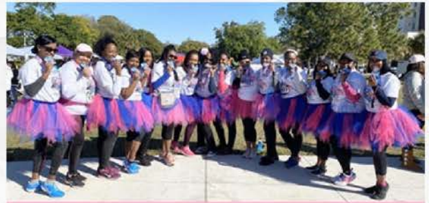
Greater Tampa Foundation Committee Members

Jack and Jill of America, Inc. is a national organization of mothers who nurture future African-American leaders ages 2-19. A part of the organization's mission is to focus on educational programming, community service, legislative advocacy, and philanthropic giving. Locally, for more than 35 years, the Greater Tampa Chapter (GTC) of Jack and Jill of America, Inc. has been committed to making a difference in the lives of all children. By partnering with the Tampa Bay community, GTC provides enriching educational, cultural, and signature programming focused on children. Some of GTC's efforts include supporting Abe Brown Ministries' annual Christmas Angel program, Miracles Outreach, Metropolitan Ministries, Johns Hopkins All Children's Hospital, and the NICU of Tampa General Hospital.